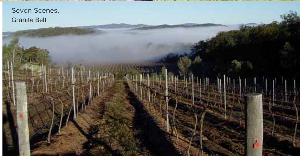
Seven Scenes, Granite Belt

Next stop is the Sirromet winery at Mount Cotton. From there, our wine travels the world, pleasing palates and collecting a swag of awards along the way. And it's all because we gave our fruit the best possible start in life.